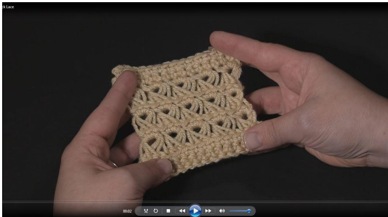
Broomstick Lace screen capture

There are endless variations on Broomstick Lace, also known as Jiffy Lace, and ways it can be combined with other stitches to create wonderful fabrics. The version demonstrated here is the most basic of these - master this and you can do the rest! For broom stick lace you will need one extra tool in addition to the usual yarn and hook - a dowel, large knitting needle, or even an actual broomstick! For the purposes of these instructions, it will be referred to as the needle.