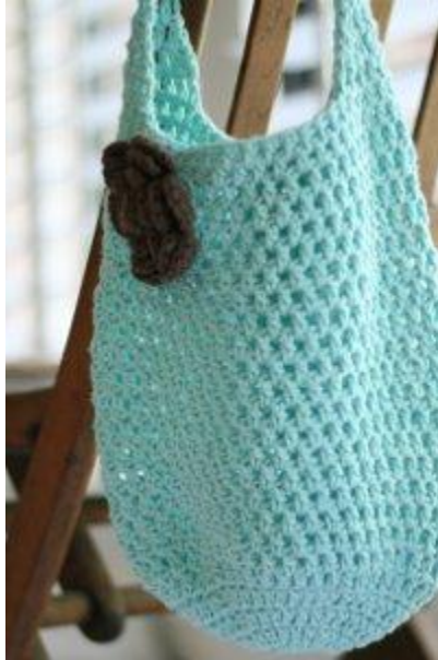
Two Hour Tote

If you have a few hours to spare, then you can complete this Two-Hour Tote pattern. This free crochet design is just the right size for kids to use and is great to carry to the farmer's market during the summer. Add a cute flower or bow embellishment to personalize the look of this homemade tote bag. It could also be used as a yarn storage bag; it's just the right size to fit a few skeins of cotton weight yarn.