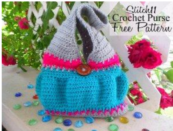
The Perfect Crochet Purse

If you're a mother to a toddler or baby, you know just how difficult it is to carry multiple things in your purse for yourself and your child, and then you have your child attached at the hip (literally). No woman wants a huge purse to lug around with all that, which is where The Perfect Purse comes into play. This free crochet bag pattern has a shorter strap with a smaller bag portion so you can still fit the essentials while allowing the bag to stay on your shoulder instead of falling down. The special spike stitch is used giving the bag a bit of a funky look.