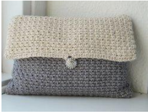
Art Deco Clutch

This simple Art Deco Clutch is a classic-looking clutch that's the perfect size for errands around town. It's big enough for your daily essentials including car keys, wallet, and cell phone. Using thin cotton yarn for this free crochet pattern will prevent the bag from becoming too bulky. The best thing about this pattern is that it's easy enough for beginners to complete. Be sure to include the lining to ensure the bag holds its shape over time.