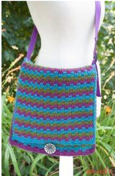
Mesmerizing Messenger Bag

It's impossible not to fall in love with this Mesmerizing Messenger Bag. This homemade bag is stylish and roomy, which makes it the perfect bag to tote around every day. It's also great for using as a school book bag because it's big enough to store a 3-inch wide binder. The long over the shoulder strap makes it easy and comfortable to carry, and the optional strap adjuster is a nice added touch. This free crochet pattern also includes instructions for adding fleece lining, which is a great way to ensure your valuables stay protected.