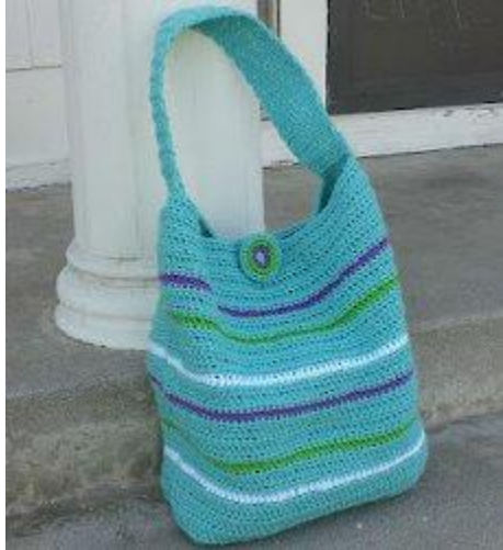
Striped Crochet Bag with Button

Make this Striped Crochet Bag with Button if you're in the market for a sturdy, reliable tote. This free crochet pattern is easy to follow and makes a bag that is both pretty and functional. Plus, it's roomy and will hold its shape well if you use Red Heart Yarn as suggested.