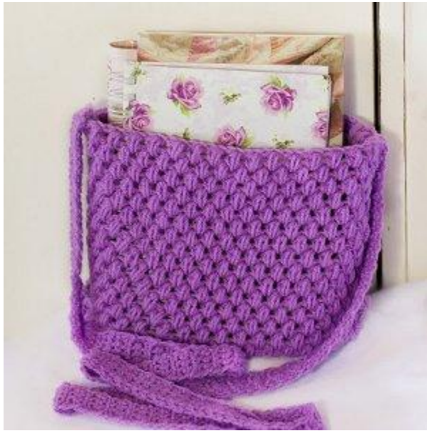
Pretty Purple Purse

Ladies, treat yourself to a new bag with this free crochet pattern. The Pretty Purple Purse is a great addition to your purse collection. It's the perfect size for everyday use. This casual looking bag is made using the puff stitch and can be made in any color yarn that you prefer. The pretty purple hue shown here is great for the spring and summer months.