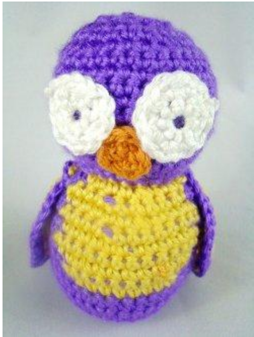
Cute Cuddly Owl

Simply Soft Caron yarn is used to make this cute little guy.