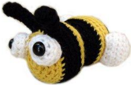
Bumble Bee Crochet Pattern

Don't worry; this is one bumble bee that won't sting you! This adorable Bumble Bee Crochet Pattern is an easy crochet pattern that measures 5.5 inches long when completed. Use 3 different colors of yarn and an H hook to complete this pattern.