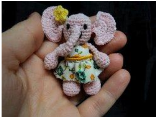
Gracie the Tiny Elephant

Girls of all ages are sure to fall in love with Gracie the Tiny Elephant. Her happy expression will undoubtedly bring a smile to anyone's face. Follow this amigurumi crochet pattern to complete this cute project.